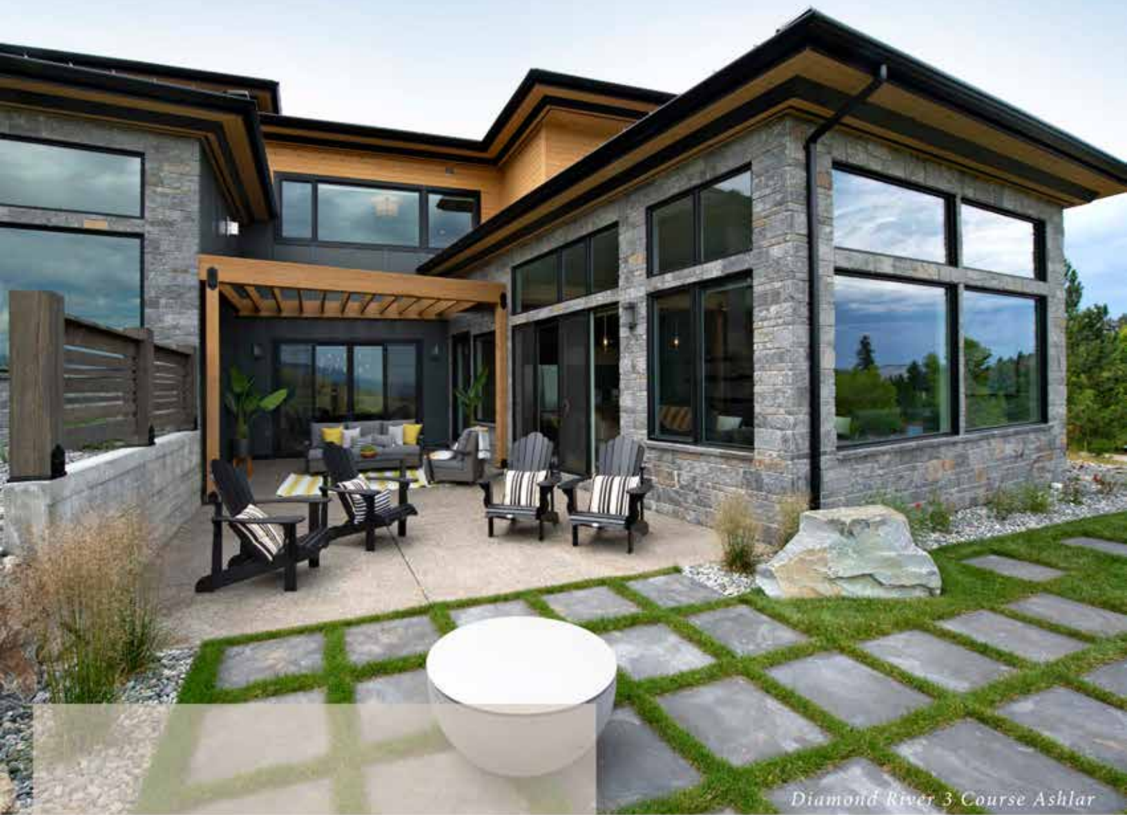
Diamond River 3 Course Ashlar