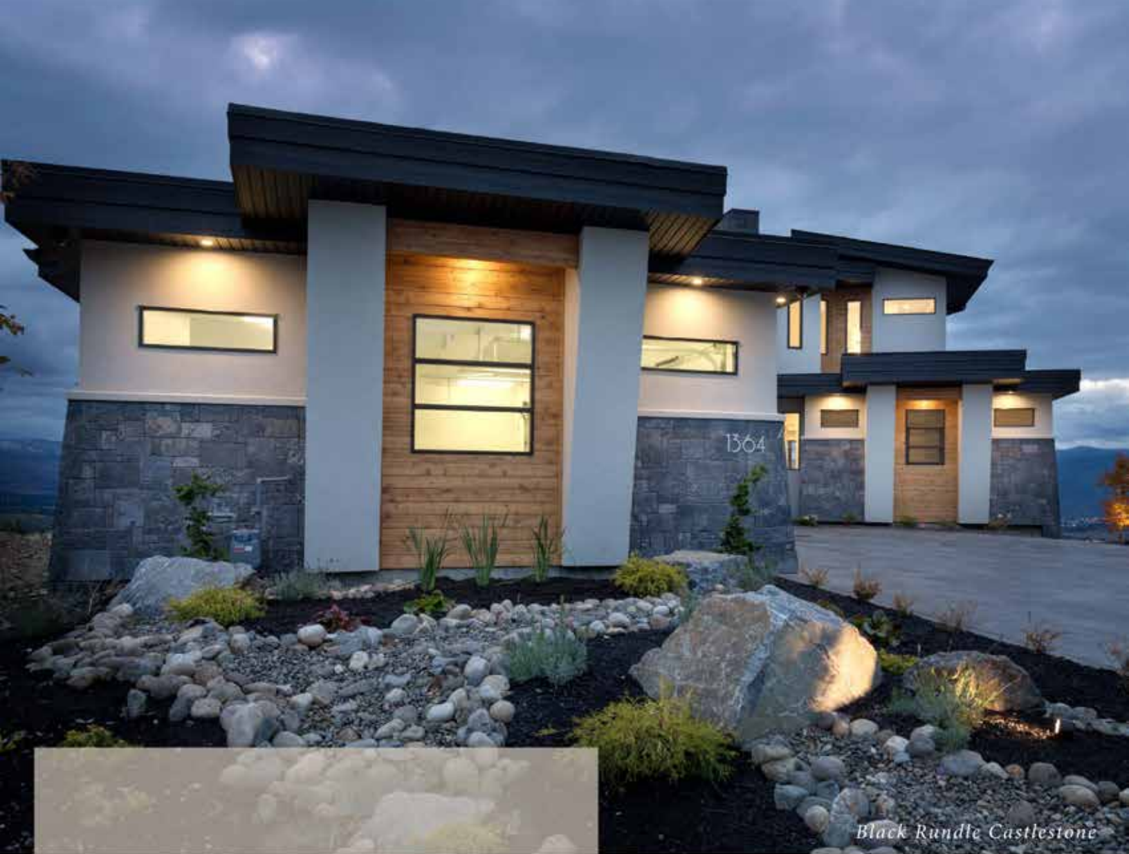
Black Rundle Castlestone