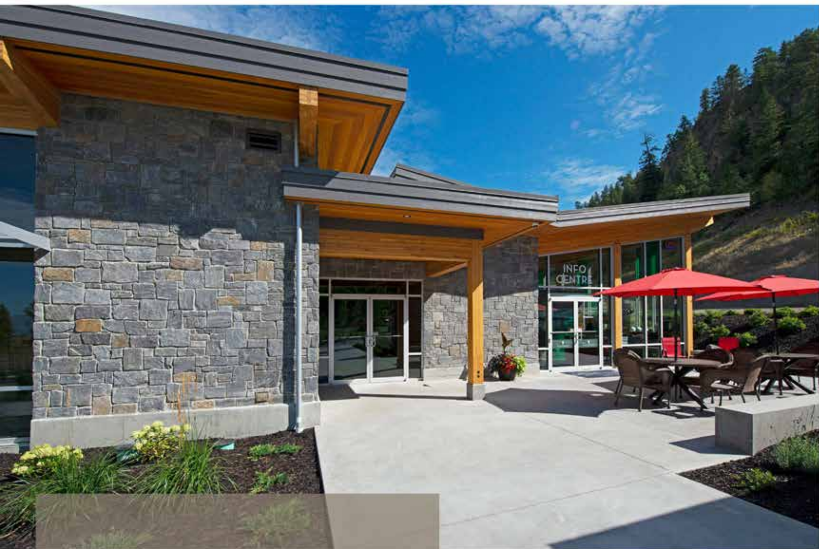
The Centre Club at Lakestone Features Pangaea® WestCoast® Castlestone