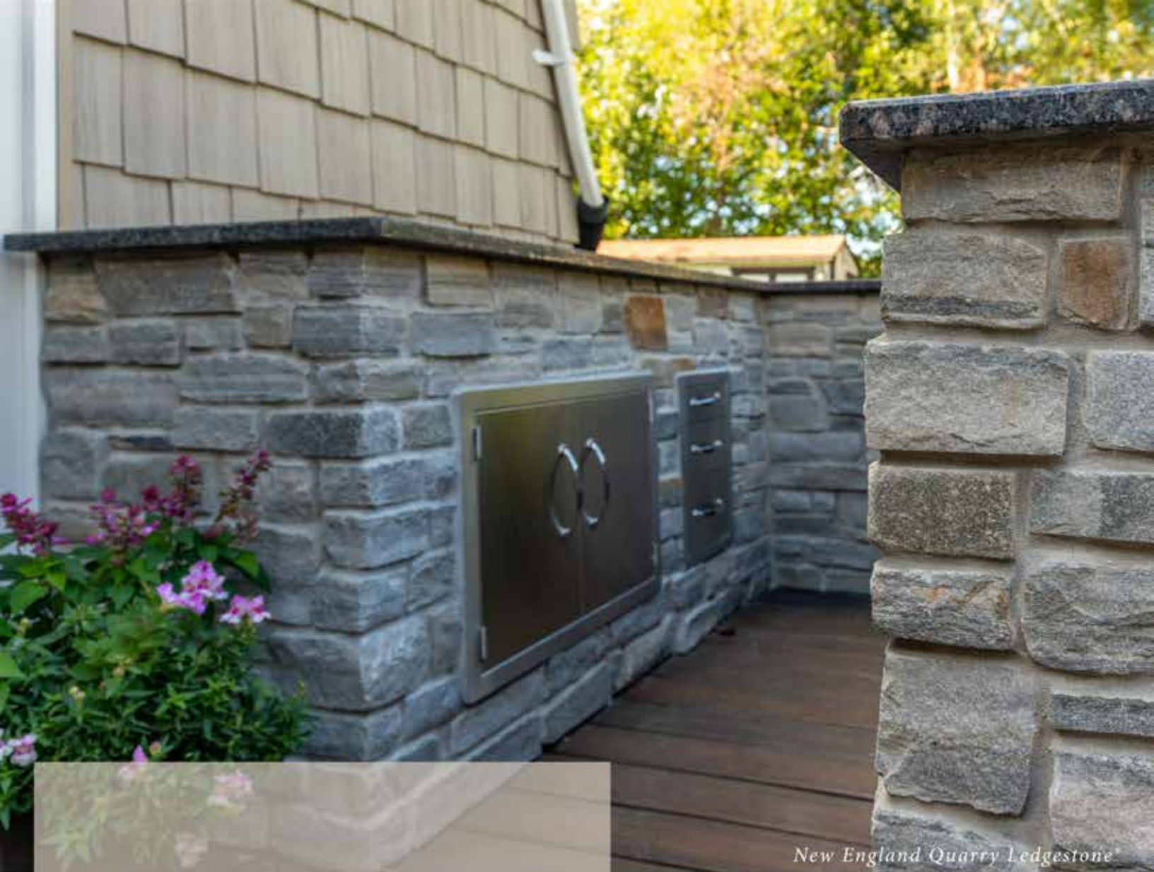
New England Quarry Ledge Stone®