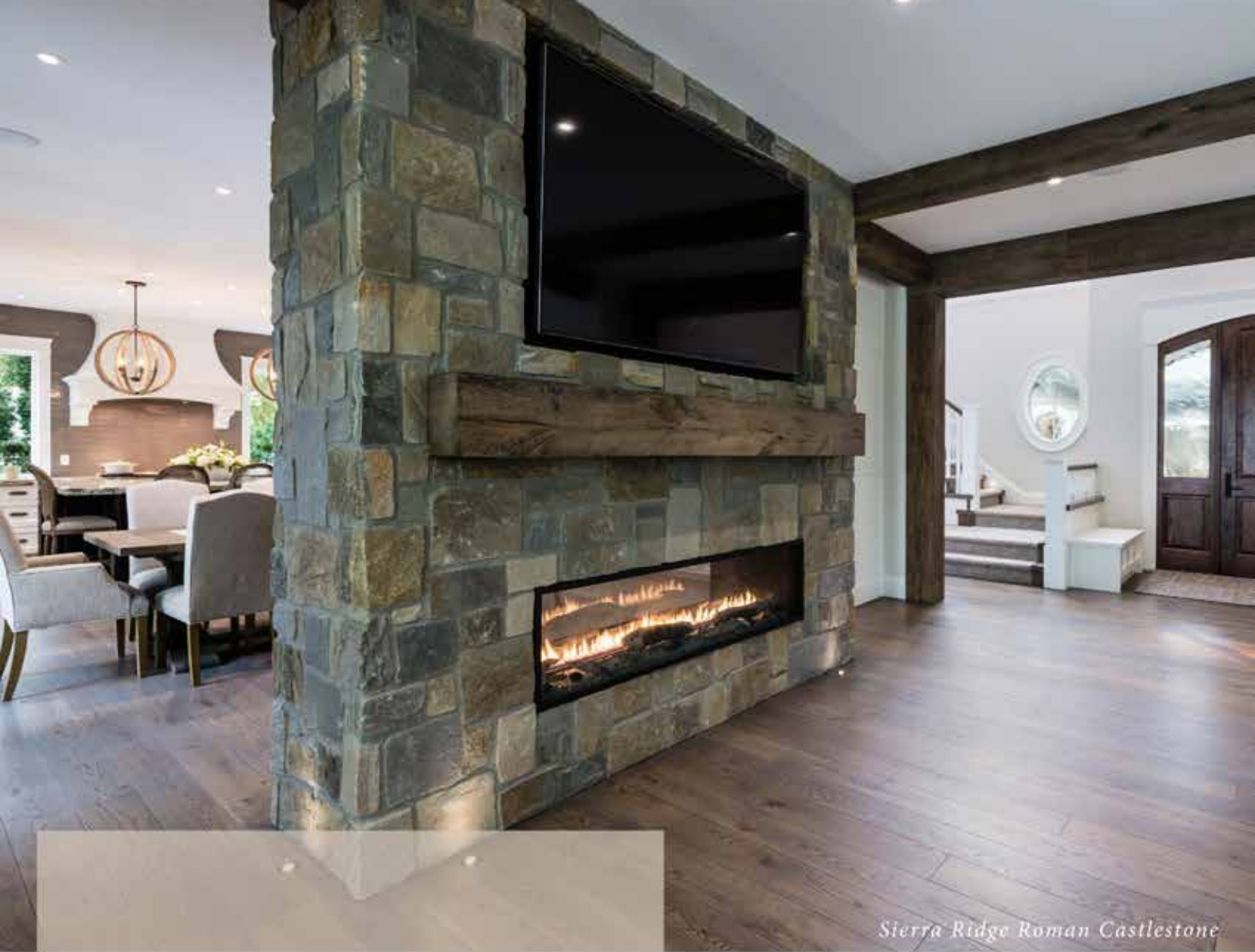
Sierra Ridge Roman Castlestone