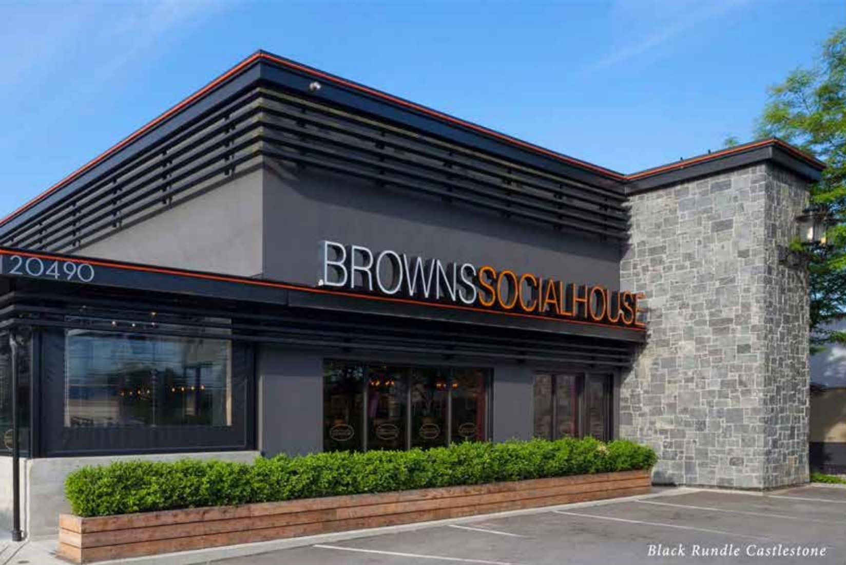
Black Rundle Castlestone